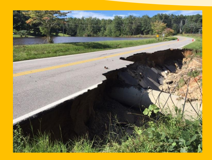
Cat B & C